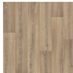
Roasted Limed Ash 3375 plank size in sheet: 166 x 1500mm w/r 9831 LRV 30