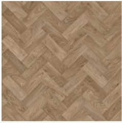
Eton Oak Parquet 3392* plank size in sheet: 76.2 x 288.6mm w/r 9822 LRV 24