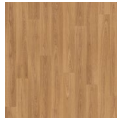
European Oak 3347* plank size in sheet: 100 x 1000mm w/r 3340 LRV 23