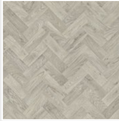
Parish Oak Parquet 3391* plank size in sheet: 76.2 x 288.6mm w/r 9841 LRV 32