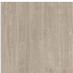
Sun Bleached Oak 3372* plank size in sheet: 200 x 1500mm w/r 3372 LRV 31