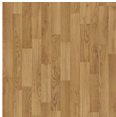
Rustic Oak 3337* plank size in sheet: 83 x 333/666mm w/r 3330 LRV 26