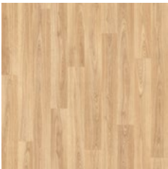
American Oak 3387* plank size in sheet: 100 x 1000mm w/r 3380 LRV 37