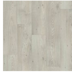
Blanched Oak 3397 plank size in sheet: 200 x 1000mm w/r 3113 LRV 42