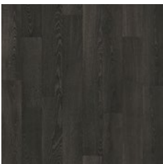
Nero Oak 3371 plank size in sheet: 125 x 1000mm w/r 9842 LRV 7