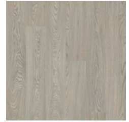
Oslo Oak 3396 plank size in sheet: 167 x 1500mm w/r 9829 LRV 32