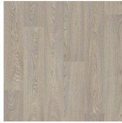
Newport Oak 3394 plank size in sheet: 167 x 1500mm w/r 9838 LRV 30