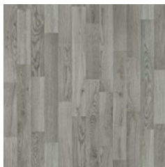
Silver Oak 3357* plank size in sheet: 83 x 333/666mm w/r 3237 LRV 23