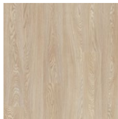
Oiled Oak 3374 plank size in sheet: 166 x 1500mm w/r 3374 LRV 37