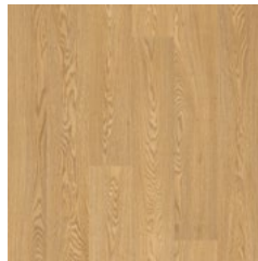
Classic Oak 3107 plank size in sheet: 166 x 1500mm w/r 3330 LRV 29